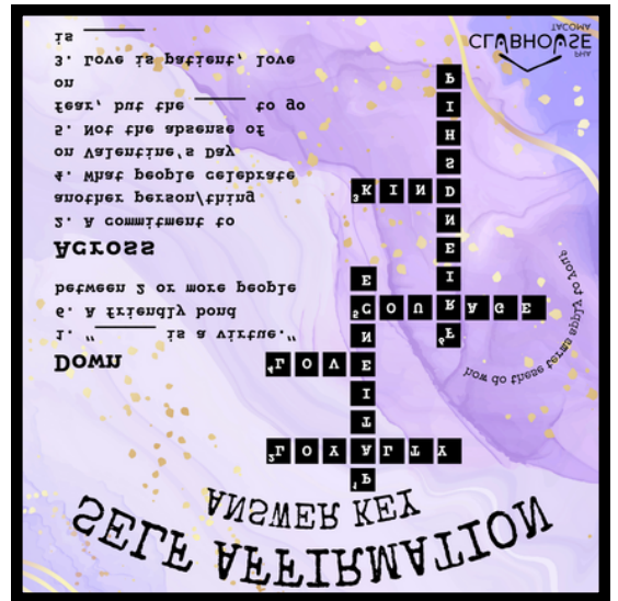
Answers to the Self-affirmation Crossword

Please Contact Us (253) 346 8436 (Text Available) PHAClubhouse.com Hours: Tuesday - Thursday Address: 4420 Portland Ave E, Tacoma, WA