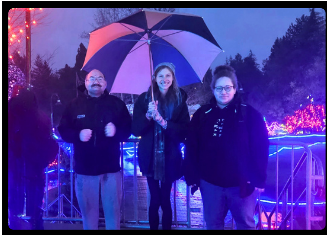
PHA Clubhouse at the PDZA's Zoolights