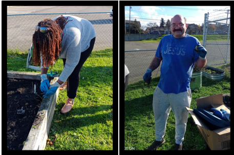
PHA Clubhouse Members Clearing the Community Garden for Winter