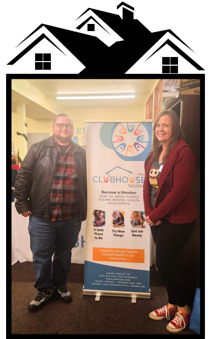
Housing Presentation by Associated Ministries at PHA Clubhouse