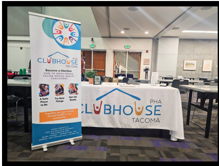
UWT Social Work and Criminal Justice Fair