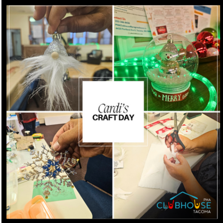
Cardi's Crafting Day