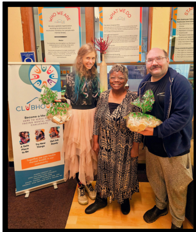
Donating Cookies to FOB Hope Veteran's Village